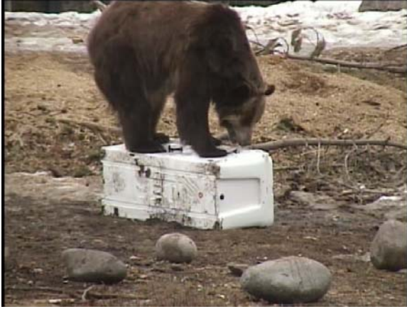
Figure 3. A Cooler being tested at the Grizzly & Wolf Discovery Center.